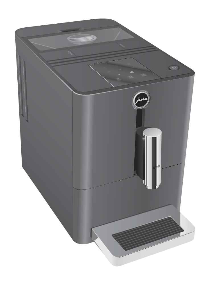
Instructions for use for ENA Micro 1